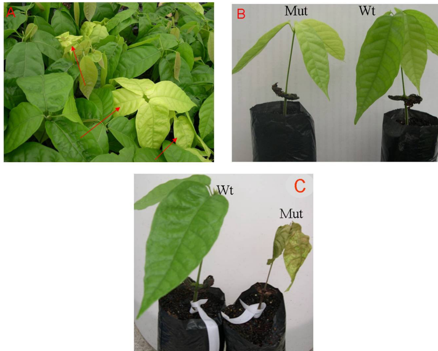
Figure 2. Mutant (Mut) and wild-type (Wt) seedlings of the Theobroma cacao hybrid Pa 169 x Pa 30 at 15 (A, B) and 60 (C) days after emergence of seedlings. Note the leaf chlorosis in the mutant seedlings (A - red arrows, B), followed by seedling death (C).

In comparison, the photosynthetic activities of wild-type seedlings resulting from reciprocal crosses did not differ (Figure 1). This proves that inheritance of this gene is simple nuclear and not maternal. The fact that the leaves of mutant seedlings had negative CO 2 exchange is due to damage in the PS2 reaction centers of the photosynthesis photochemical phase, resulting in blockage of electron transport, which makes photosynthetic activity impossible (Almeida et al., 1998).