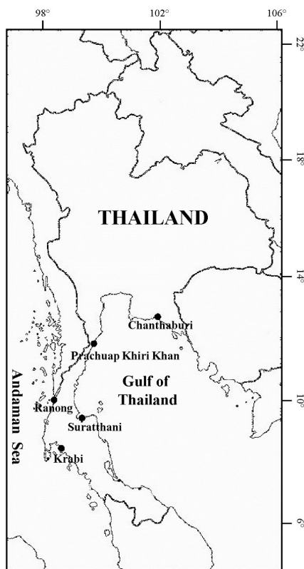
Figure 1. Sampling collection sites of Portunus pelagicus in Thailand.

One hundred and nine individuals of blue swimming crab ( P. pelagicus ) were live-caught from Chanthaburi ( 12^{\circ}35'60'' N, 102^{\circ}9'0'' E, N = 23 ), Prachup Khiri Khan ( 11^{\circ}49'0'' N, 99^{\circ}47'60'' E, N = 20 ) and Suratthani ( 9^{\circ}7'60'' N, 99^{\circ}19'0'' E, N = 21 ) located in the Gulf of Thailand and Ranong ( 9^{\circ}58'0'' N, 98^{\circ}37'60'' E, N = 23 ) and Krabi ( 8^{\circ}4'0'' N, 98^{\circ}55'0'' E, N = 22 ) located in the Andaman Sea (Figure 1). The whole specimens or muscle dissected from the first walking leg of each crab were kept at -30^{\circ}\text{C} until used.