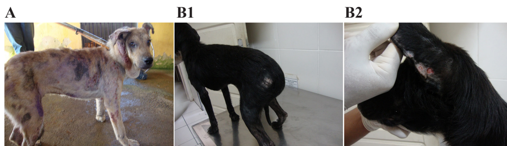
Figure 2. Dogs present cutaneous lesions and clinical changes suggestive of Leishmania spp. A. Dog parasitized by Demodex canis PCR-negative for Leishmania spp, B1. and B2. Dog presents ulcer in ears and PCR-positive for Leishmania braziliensis .

The kappa test between the ELISA and PCR results revealed a low level of agreement with K = 0.107 and P = 0.029 .