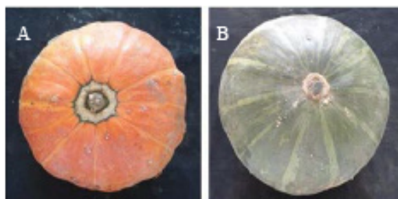
Figure 1. A. Paternal parent (06820-1) with orange rind. B. Maternal parent (98-2-351) with gray rind.

The JoinMap version 3.0 software (Stam, 1993; Van Ooijen and Voorrips, 2001) was used to construct the linkage map with logarithm (base 10) of odds scores of 4.0-6.0 (Kosambi, 1994). Mendelian segregation was tested using the chi-squared test performed under the “Locus Genotypic Frequency” command. The markers were sorted based on the chi-squared test at a P value of <0.05. Mapchart 2.1 was used for constructing the maps (Voorrips, 2002).