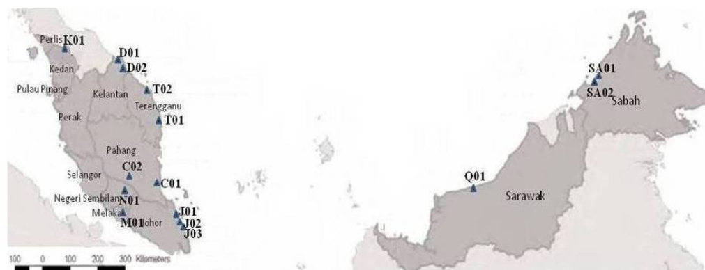
Figure 1. Map showing populations of Rhodomyrtus tomentosa populations sampled.