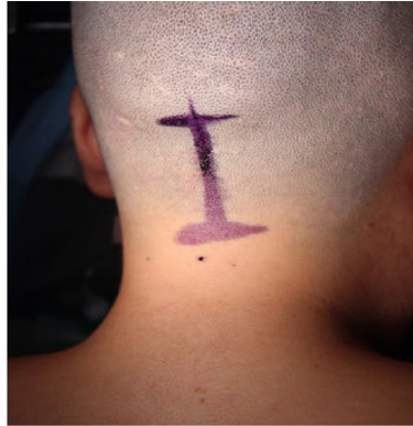
Figure 1. About 5cm surgical incision in the midline around the foramen magnum (from 1 cm below the external occipital protuberance to the C2 interspinalis).

the prone position. Their heads were fixed and necks were bent slightly forward. Subsequently, a median incision was made from 1 cm below the external occipital protuberance to the C2 interspinalis, and the area from the squamous part of the occipital bone to the posterior edge of the foramen magnum was removed (Figure 1). This procedure made a bone window with a 3 x 4 cm area. The bone of the posterior edge of the foramen magnum was removed to a width of