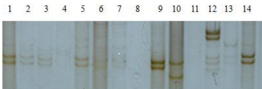
Figure 1. PCR-SSCP electrophoresis. Lanes 1-8 = results from healthy subjects; lane 9 = negative control; lanes 10-14 = results from CAD patients; lanes 1, 2, 5-7, 10, and 12-14 = mutated samples.

Compared with the negative sequencing results of control samples, abnormal bands were observed following SSCP electrophoresis in the PCR product of exon 11 from healthy controls or patients. The location of a single band or the number of bands had changed, indicating potential MEF2A mutations (Figure 1).