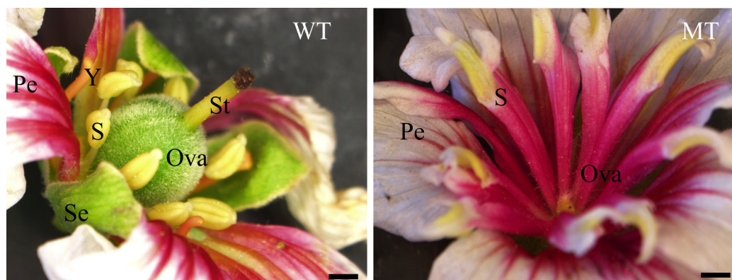
Figure 1. Characteristics of WT and MT yellow-horn flowers. Se, sepal; Pe, petal; S, stamen; Y, yellow filamentous appendages; Ova, ovary; St, style. Bar = 1 mm.

WT and MT flower buds were obtained from 40-year-old yellow-horn cultivated in Chengde City, Hebei Province, China. Both WT and MT plants were derived from sexual reproduction of WT, and were raised from naturally crossed seedlings. WT plants exhibited single-flowers, whereas MT plants produced double-flowers. Typically, mature flowers of WT feature three bracts, five sepals, five petals, eight stamens, five yellow filamentous appendages, and one pistil (Figure 1). In MT, supernumerary petals are observed in several additional whorls. The double-flower has approximately 17 to 25 petals and petal-like appendages, three bracts, five sepals, and deformed stamens and pistil (Figure 1). Within each type, individuals have the same kind of flowers, and the flower characteristics remain stable every year. Due to the limited number of MT, 10 representative flower buds were collected from three individuals of each type in the end of March. The samples were frozen in liquid nitrogen and stored at -80°C.