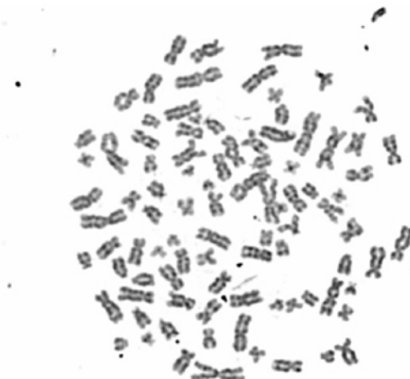
Figure 2. Metaphase of a cell from a patient with Nijmegen breakage syndrome showing tetraploidy in bone marrow cells.