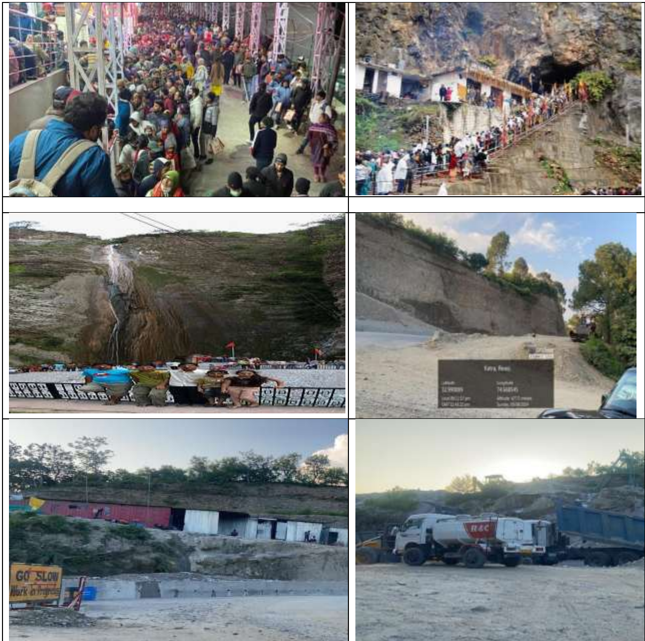
Figure 2: Anthropogenic disturbances in study area