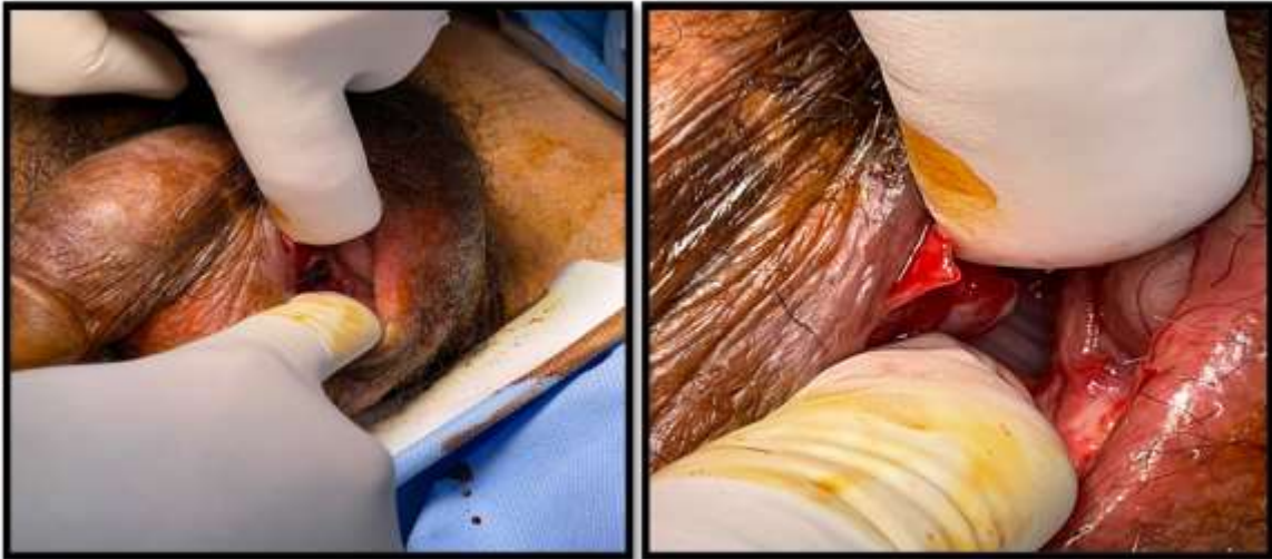
Figure 2: Surgical Exploration Findings and Urethro-Scrotal Fistula

Histopathological analysis of the left kidney nephrectomy specimen on September 4, 2023, the diagnosis was chronic pyelonephritis with end-stage renal disease in the left kidney, and the specimen tested negative for malignancy.