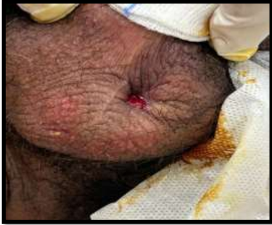
Figure 4: healing of scrotal fistula