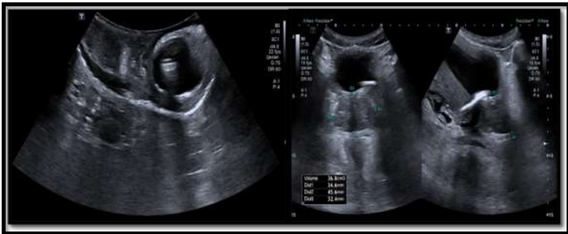
Figure 1:Imaging Findings from Scrotal Ultrasound(Ballon of foley catheter within left scrotum)

On December 25, 2022, from a scrotal ultrasound -Figure (1)- revealed both testes within the scrotal sac, normal in size and shape, with normal vascularity and unremarkable epididymis. However, the left scrotal compartment exhibited a dense turbid fluid collection. The urinary bladder was moderately distended with a thick, irregular wall and dense turbid fluid content displaying a fluid-fluid level, with a left DJ ureteric stent visualized and bilateral hydronephrosis noted and balloon of foley catheter within It scrotum ,this explained the false passage of the catheter. On March 5, 2023, a CT scan of the kidneys, ureters, and bladder showed the right kidney to be normal in size, shape, and position, with the pelvicalyceal system intact; however, it contained gravel in the lower calyx and no ureteric dilation. The left kidney was in a normal position but exhibited a markedly dilated pelvicalyceal system and contained no gross renal stones; a left ureteral stent was present. The urinary bladder appeared empty with a markedly thickened wall and was accompanied by a suprapubic catheter, with no stones detected.