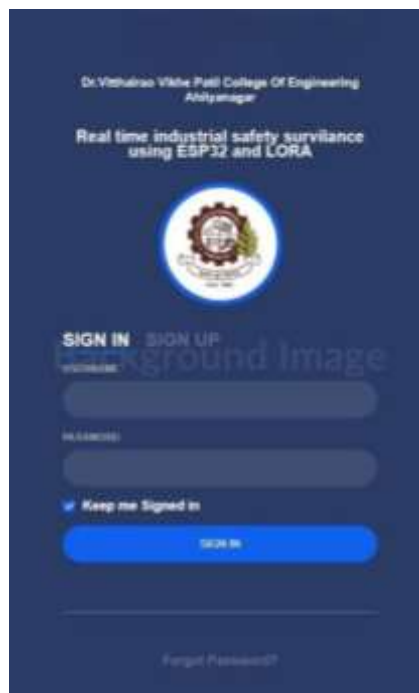
Fig. 3. Login Interface for the Industrial Safety Monitoring System

During testing, the dashboard displayed sensor readings such as temperature, gas level, and humidity. The system recorded a temperature of 34°C, which is within the safe operating range. The gas level was measured at 559 PPM, indicating safe conditions based on the predefined threshold levels. The humidity level was recorded as 59% RH, which is also within normal environmental limits.