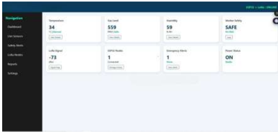
Fig. 4. Real-Time Monitoring Dashboard of the ESP32-LoRa Safety System